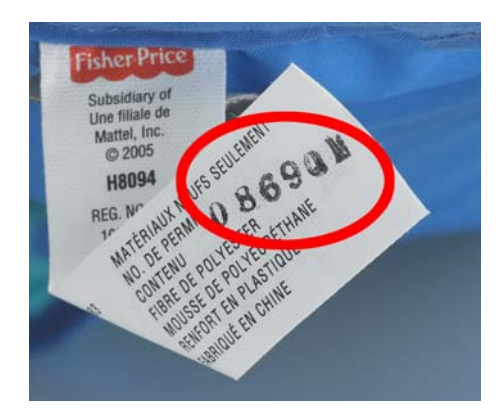
H8094 Ocean Wonders™ Kick & Crawl Aquarium (Date code located on tag)